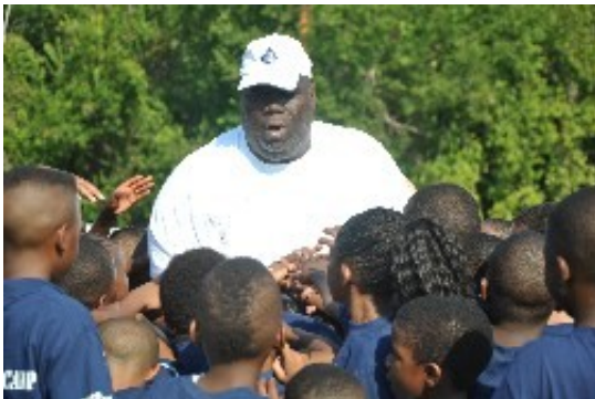
Russell Maryland Coaches the Campers