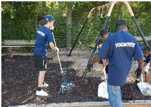
Instant RePlay Build Day Volunteers