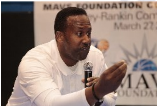
Mavs Great Rolando Blackman teaches Teamwork

In an effort to share with youngsters the work ethic, dedication and individual desire that make up the character of many professional athletes, the Pro Players Foundation has developed Character Camps. These camps give youth of all ages the opportunity to learn the importance of character, integrity, purpose and responsibility in everyday life while simultaneously developing their athletic abilities.