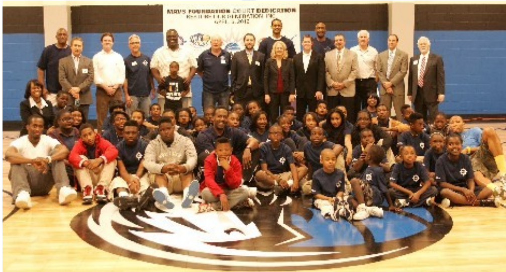
Court Dedication & Character Camp with the Mavs