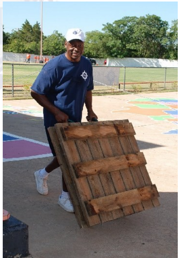
Dallas Cowboy's Great Charles Haley Working Hard