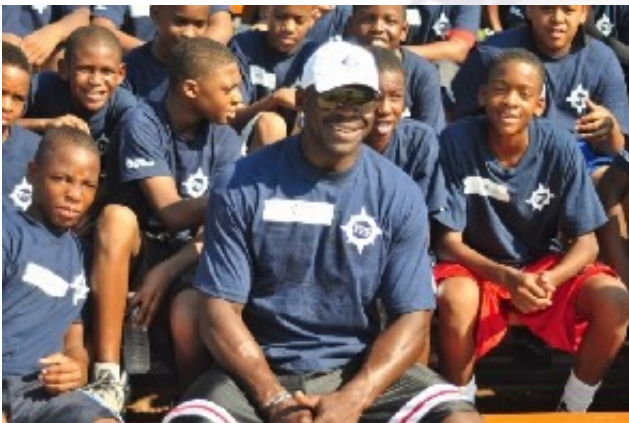
Michael Irvin working with Character Campers