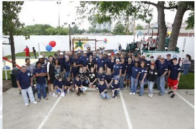
PPF teams with the Star's at a Playground Build Day